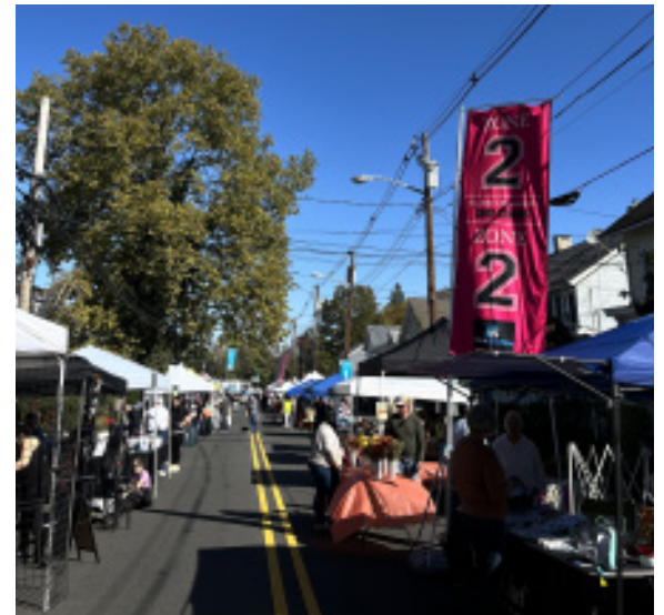
Over 200 vendors lined Downtown Matawan