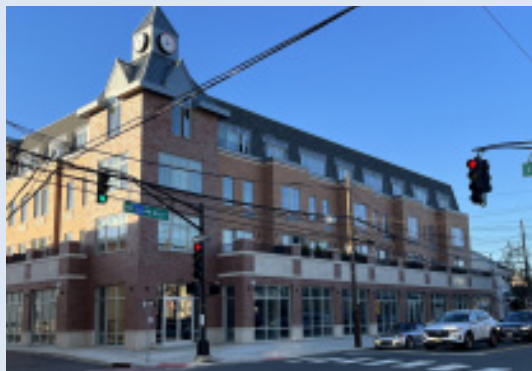
Matawan Town Center replaced the abandoned CTown Supermarket

Empty storefronts and vacant buildings have been replaced with new businesses. Eyesore properties, like the old Gulf Station, have been demolished. The abandoned CTown Supermarket has now been replaced with the Matawan Town Center, with retail on the street level and