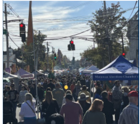
Over 4,000 people attended this year's Matawan Day

Election day is Tuesday, November 8th, and polls are open from 6am to 8pm. ■