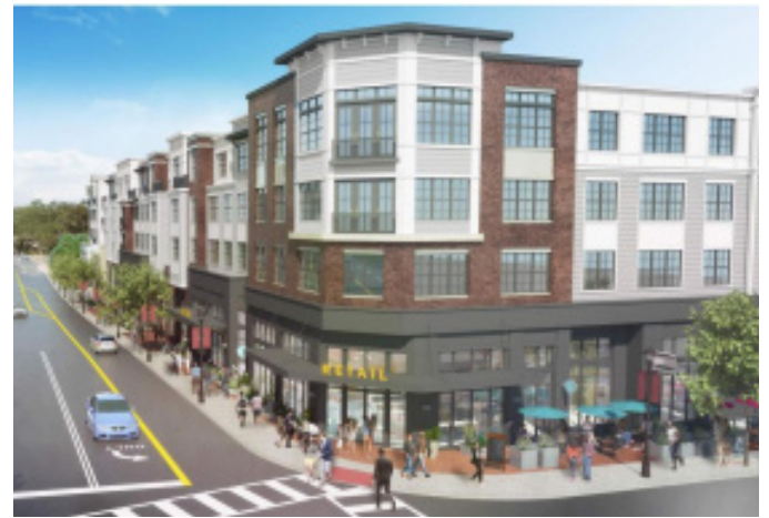
Matawan Junction Rendering, Corner of Main Street and Aberdeen Road

The approved plan includes over 10,000 square feet of retail space for restaurants, bars and shops. Market rate apartments will